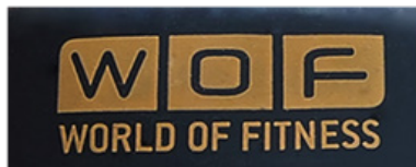
Logo produced through screen printing