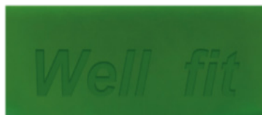
Logo engraving without color fill