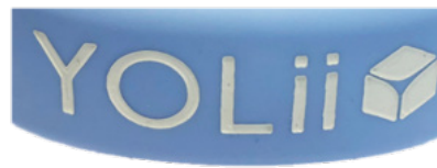
Logo engraving with color fill